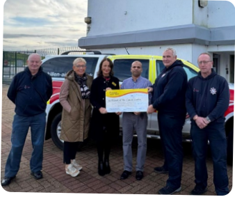
Enniskillen Airport with Fermanagh Fundraising Group