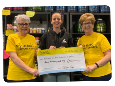
Alpha Gym with our Dromore Fundraising Group